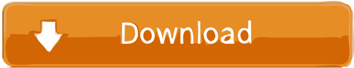
Image2Punch Pro 2.1 Crack And 23